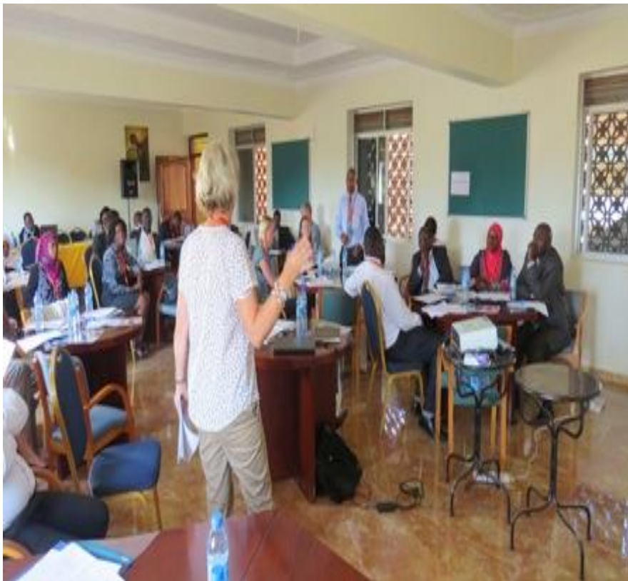
Photo 10. Participants in the NCD meeting

The discussion exposed how the NCDs are threatening the achievement of the Millennium Development Goals (MDGs). The three day meeting provided an opportunity to discuss the new East Africa Civil Society Survey report on Non Communicable Diseases with emphasis on the dangers, gaps, good practices, and evidence based platform for further action and the commitment of the civil society in responding to Non Communicable Diseases (NCDs). The delegates concluded the workshop with the East Africa Civil Society NCD Charter with the intention of presenting the results at the United Nations conference in the United States of America on the 11th July.