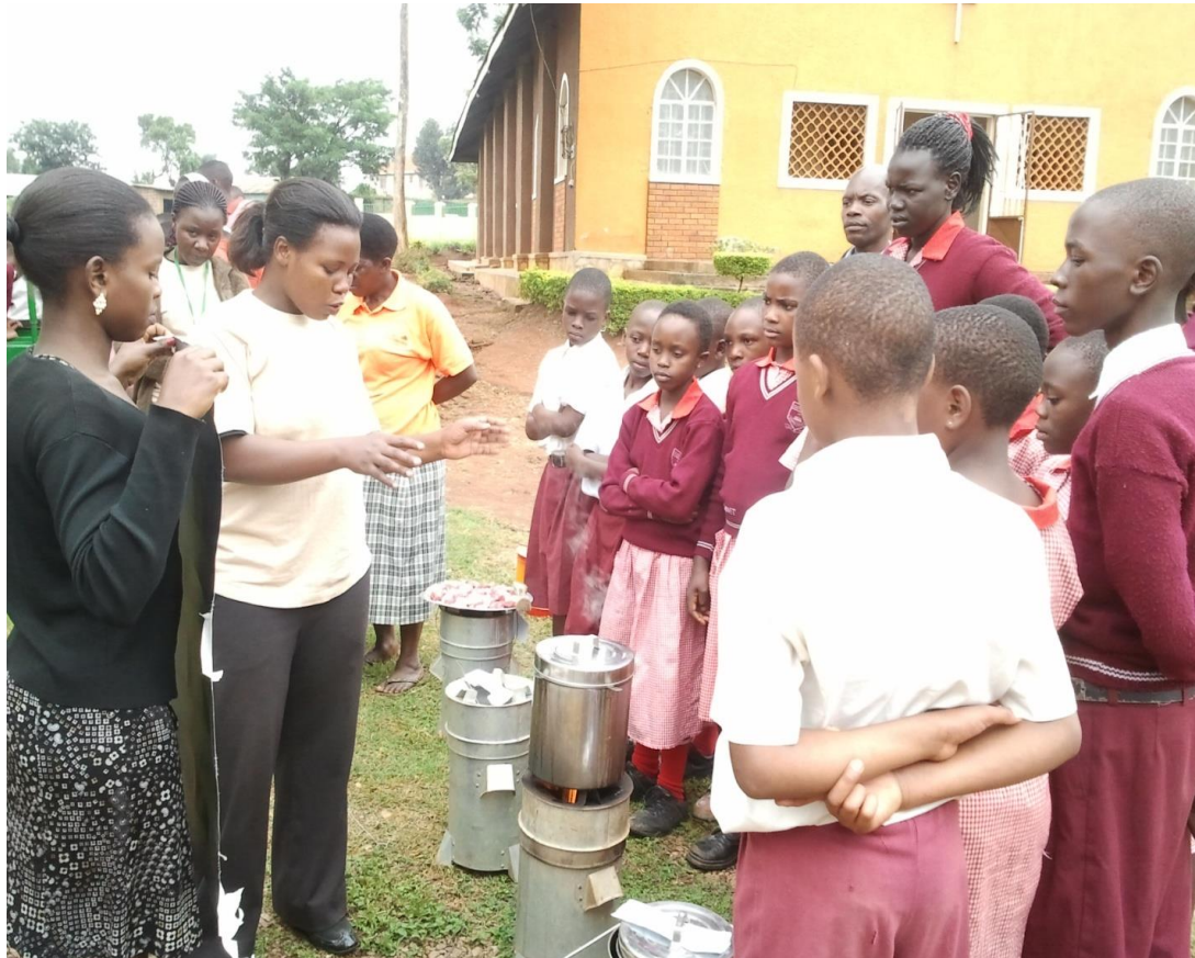
Photo 5. JEEP staff explaining to students of DavJan primary school how dangers of smoke and high fuel costs can be avoided by adopting improved stoves.

JEEP exhibited number technologies which included; small solar lamps and big solar installations, solar toys, mud stoves, hay baskets, water filters, reused plastic materials, barbecue, Top Lit Up Draft (TLUD) stoves, different tree species and briquettes .