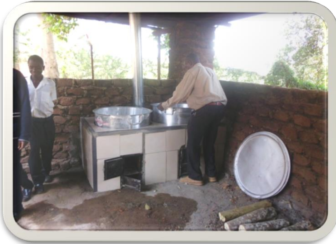
Photo 4. Institutional Energy saving stove at Corner Stone Senior Secondary School –Wakiso