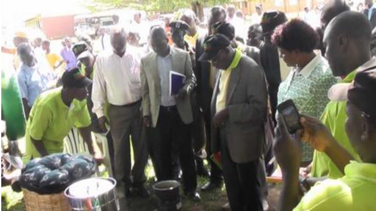
Photo 8. JEEP staff exhibiting energy saving products