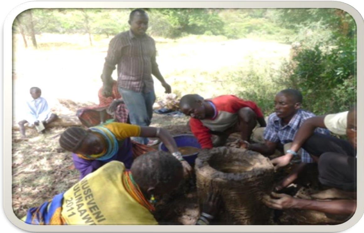
Photo2. JEEP staff trains participants in stove construction in Rupa Sub County Moroto district