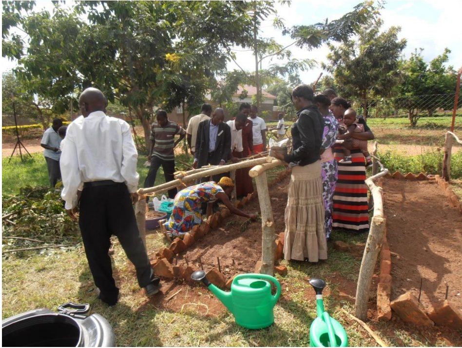
Photo1. JEEP facilitator demonstrating seed sowing in the bed