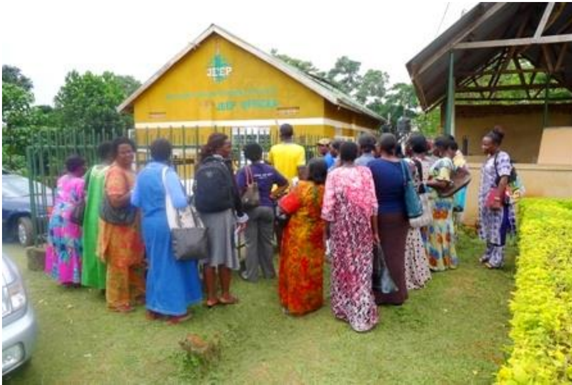
Photo 12. The groups of women visitors learning about bio gas as an alternative renewable energy that they could switch to.