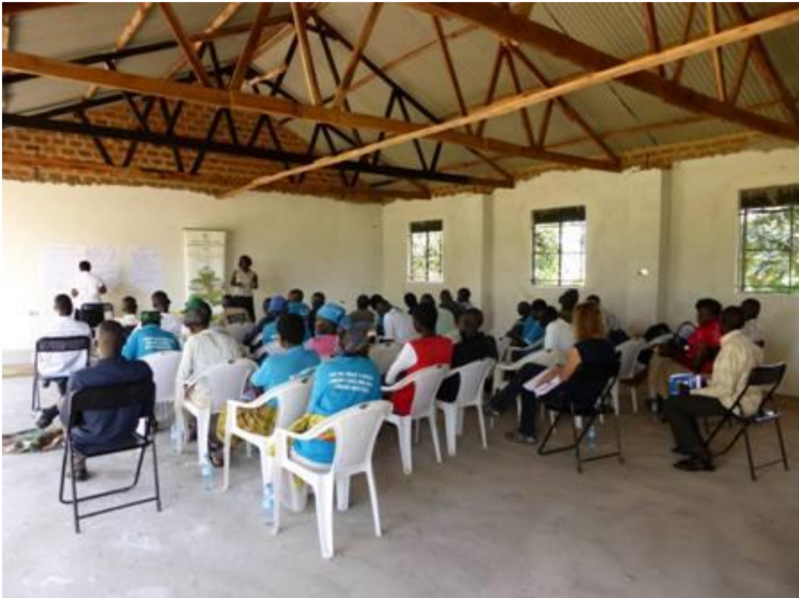
Photo 13. 40 farmer groups under Lutheran World Federation (LWF) learning about the efficiency of the Rocket Lorena energy saving stove at the JEEP Center