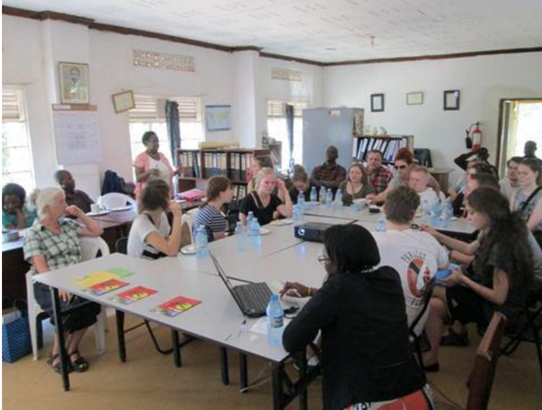
Photo 11. Students from Denmark during visit at JEEP