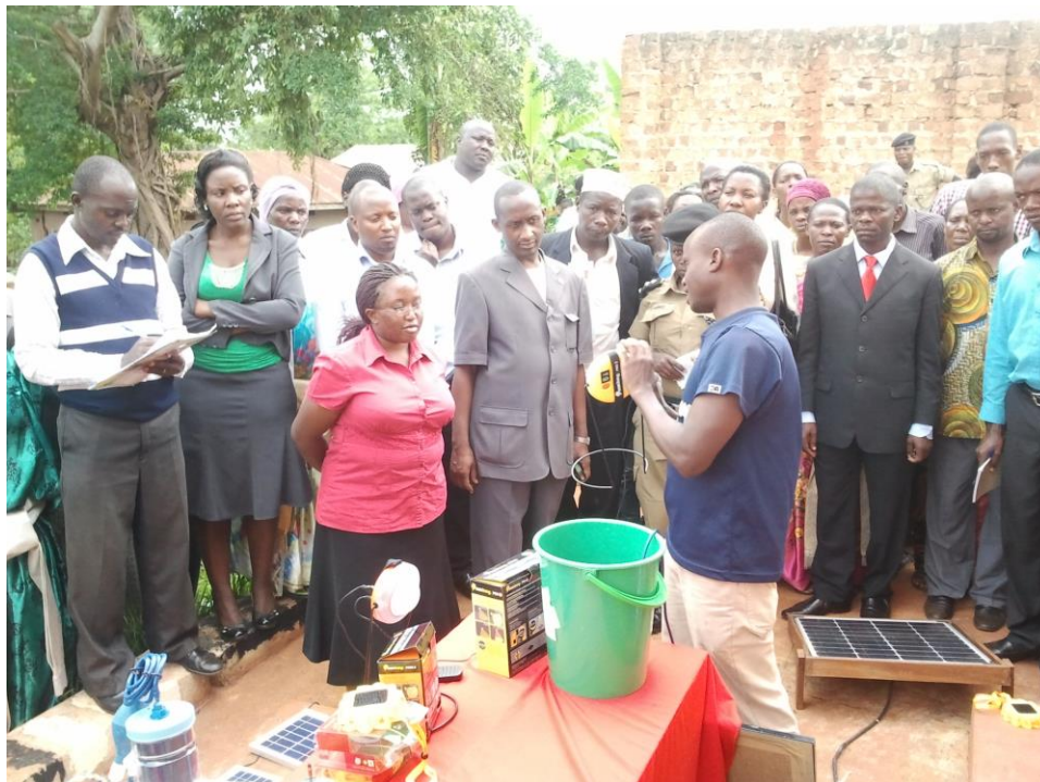
Photo 7. Mpigi district RDC and other officials listening to JEEP staff explaining how to use a solar lamp

On the 20 th June, Mpigi district Local Government organized a District Environmental Day as one of their commitments during the district leaders seminar. The celebrations took place at Kanyike Primary School and a number of schools, district dignitaries, and the local people attended. The schools performed songs, drama and poems concerning environmental degradation and how to preserve our environment. The theme for this year's celebrations was ``Raise your voice, Save Uganda's fragile eco-systems. The Mpigi district RDC was the chief guest